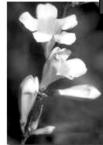
SC's state flower