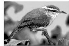
SC's state bird