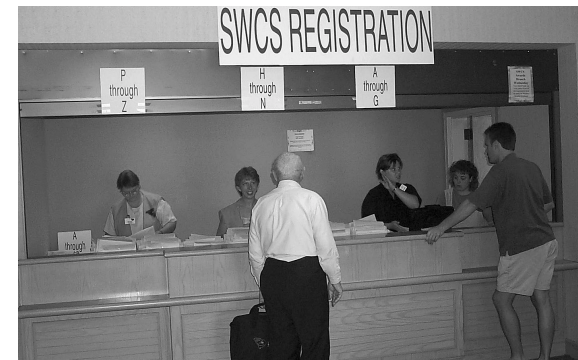
Volunteers at the registration booth welcome conference participants on Saturday.